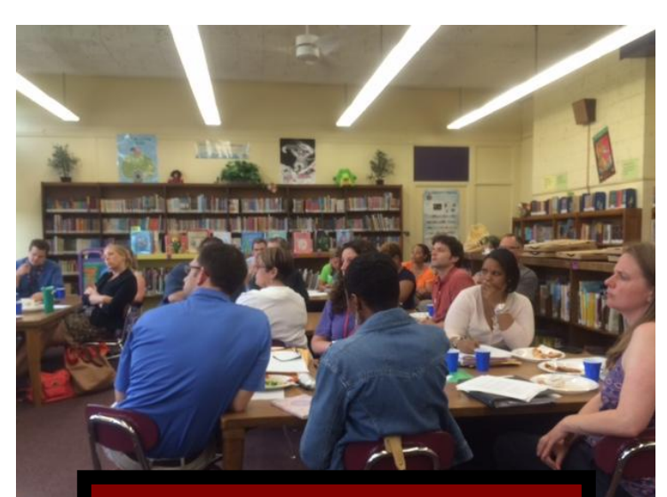
SHTA Representatives meeting at Onaway School.